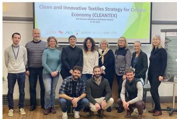
Cleantext partners during their meeting in Roubaix

After the meeting, partners had the chance to visit ENSAIT facilities and labs.