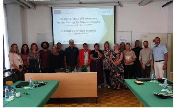
Cleantex partners during their meeting in Ljubljana

After the meeting, partners had the chance to visit UL facilities and labs.