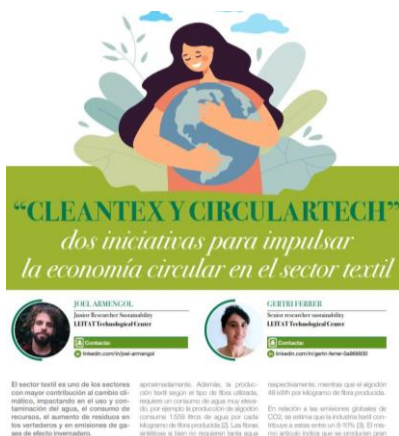
Leitat publication cover