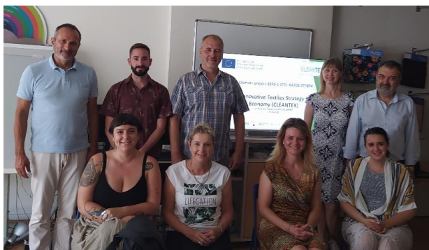
Partners during the meeting in Athens

The IO2, that will dynamize students for seeking textile solutions from practical challenges and cases was presented. Then, LEITAT presented the IO3, the e-book that will compile practical cases on how to apply life cycle assessment and eco-design in the advanced textile manufacturing industry .