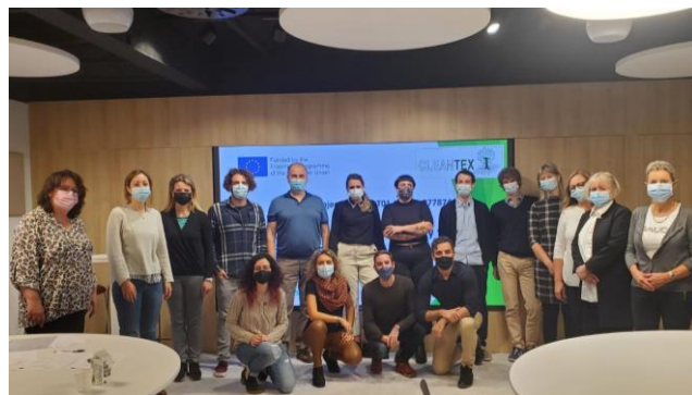
Partners during the meeting in Terrassa (Barcelona)