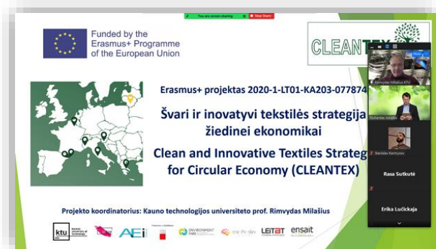
KTU presentation during the event

Another highlightable event where Cleantex project was present is the virtual conference Towards greener Erasmus+: why and how? , organized by the Lithuanian National Agency Education Exchanges Support Foundation on May 27 th . During the conference, that gathered nearly 1.000 viewers, KTU presented Cleantex project implementation and results.